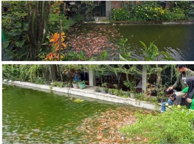
Fig. 1. Condition of The Lintangsongo Fish Pond [1]