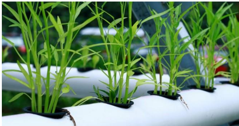
Fig. 2. Hydroponic of Water Spinach