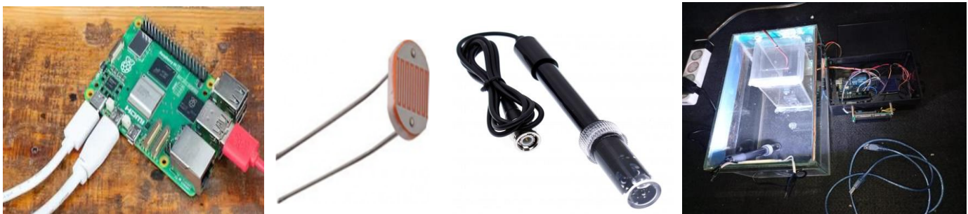
Fig. 5. Schematic Representation of The Sensing and Control

Furthermore, the primary objective was to create an automated system to detect and control these crucial components using a feedback mechanism. As previously mentioned, ammonium and calcium levels were monitored using two sensors, and two modules were created to ensure an adequate supply of these vital nutrients in case their concentrations dropped below the recommended levels. A diagrammatic depiction of the sensing, regulation, and feedback mechanism can be seen in Fig. 5 and Fig. 6.