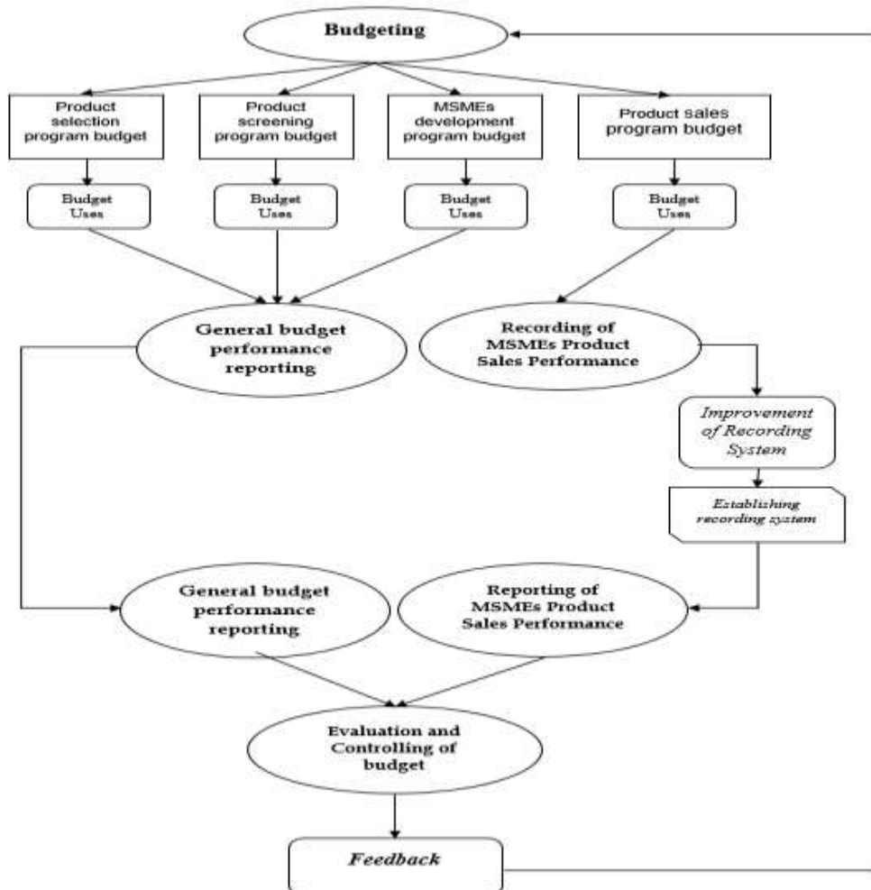
Figure 4. The planning process

On the other hand, the cooperative directly control the quality of MSME products displayed in the store. Based on product quality control, Tomira carries out stringent rules to encourage MSME products (dominated by snack products) to compete with similar manufactured products. If Tomira and MSMEs keep their consistency in maintaining or improving product quality, then the management of potential sales will be optimum.