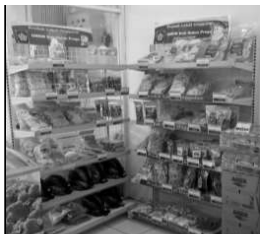
Figure 2. Shelf for MSME products in Tomira Wates

Based on Figure 3, it can be seen that the total turnover of Tomira in 2019 reached 242 million rupiahs. The number of MSME products in partnership with Tomira reached 286 items. Some of them are processed foods (chips), chocolate, coffee, tea, and sugar. Besides, there are handicrafts such as blangkon, batik cloth, and others. However, the increase in the product number is not followed by the improvements in