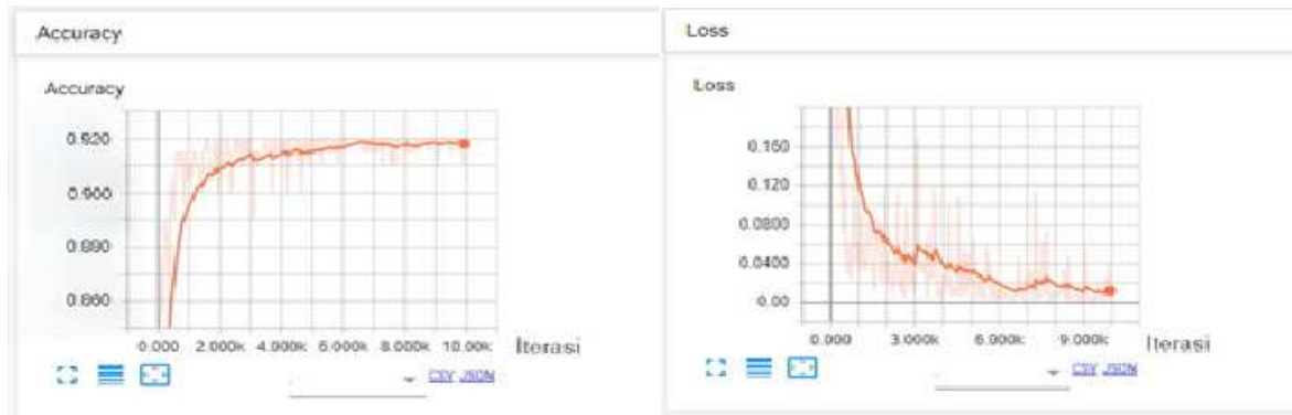
Figure 5. Accuracy and Loss

In the training process, first They accommodate a collection of related reviews and labels. By using the run function, the network can define values where They can optimize components and minimize loss. in addition, the run function is used to feed a collection of reviews and labels. This process will be repeated as many as iterations have been set.